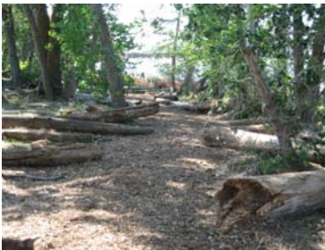
Osprey Point trail!

Travel to Glenwood, WA, and explore Conboy Lake National Wildlife Refuge at the base of Mt. Adams. Visit the Refuge, the new buildings, and the wildlife through a variety of activities, from bird walks to refuge tours. This refuge is a must see! There will not be any event at McNary Refuge Headquarters on this day. The Refuge Week Celebration will annually be rotated among at the various Refuges of the Complex.