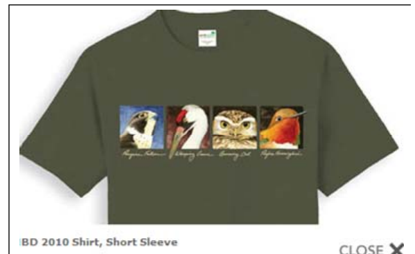
BD 2010 Shirt, Short Sleeve

The May meeting will be the perfect chance to pick up your International migratory bird day t-shirt! If you have not already given Heidi Newsome your $15 please remember to bring that too! Let's make this fundraiser a successful one!